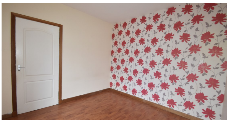
8 Bedlormie Drive