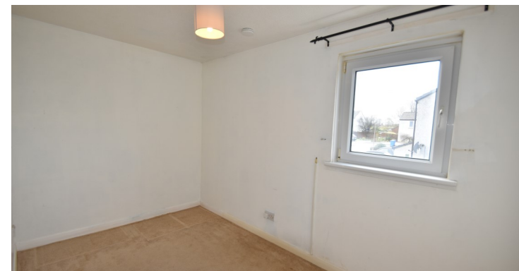
40 Laurelbank Court