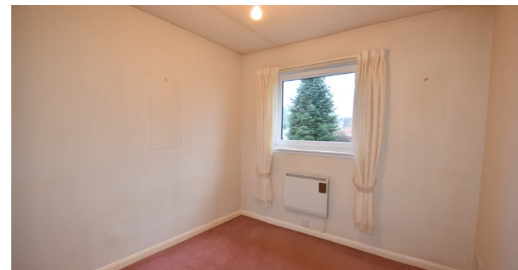
11 Foredale Terrace