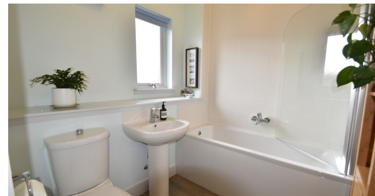
24 Spring Gardens