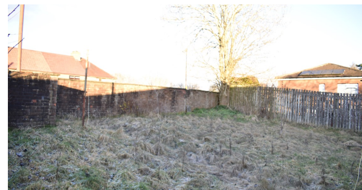
17 Almond Square