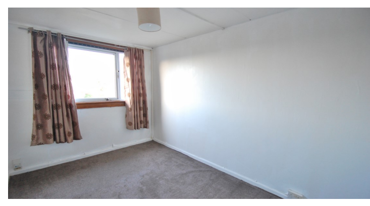
87 Brisbane Street Livingston