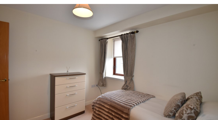
6/51 Roseburn Drive