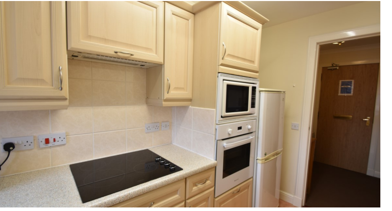
6/51 Roseburn Drive