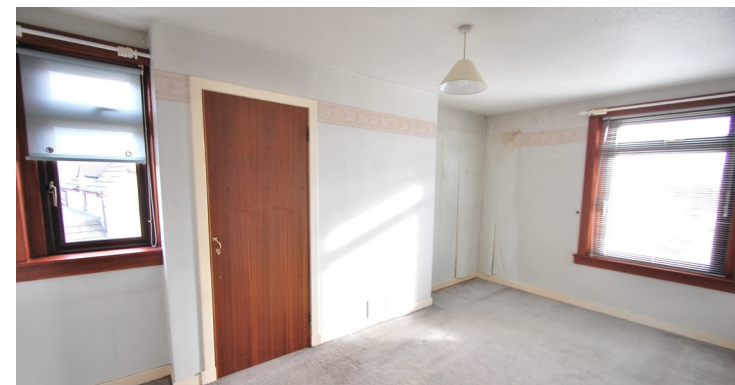
5 Grahamshill Terrace