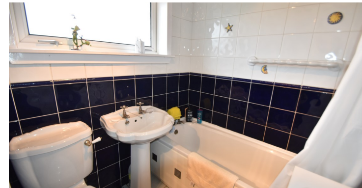
53 Kirk Brae