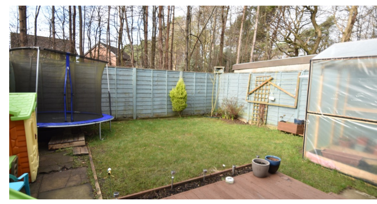
29 Primrose Place