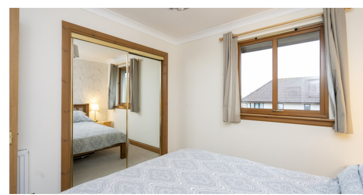
11 Silverbirch Glade