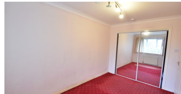
20 Happy Valley Road