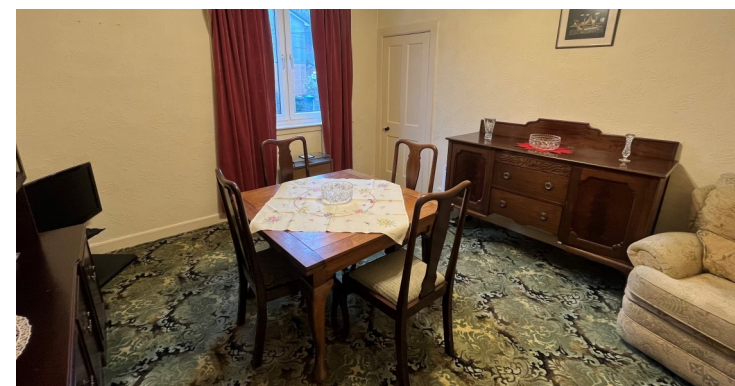
131 Ashley Terrace