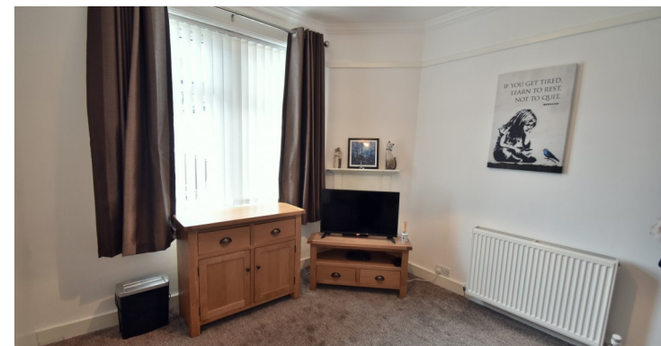
42 Race Road