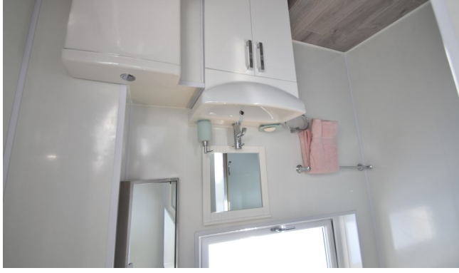
27 Gill Park