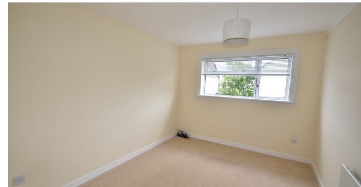
16 Esk Drive