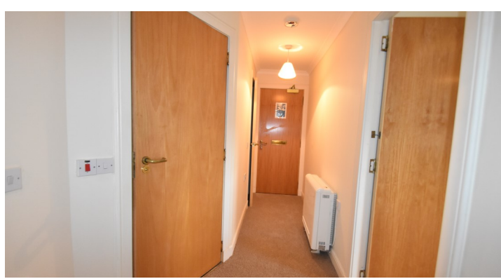
6/27 Roseburn Drive