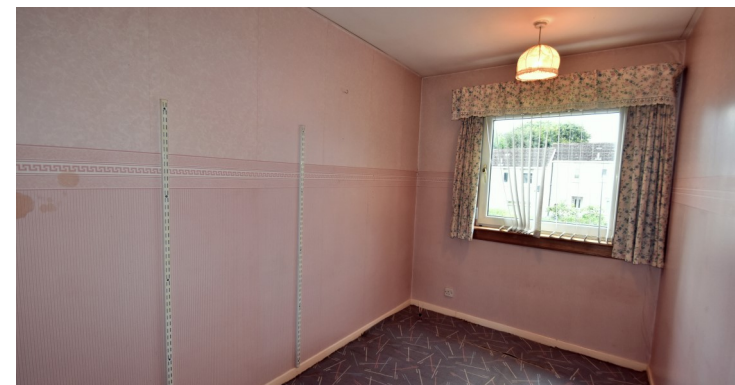
89 Granby Avenue