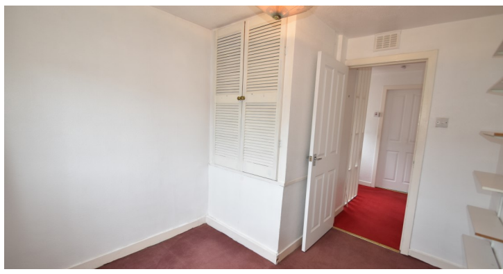
19 Parkwood Gardens