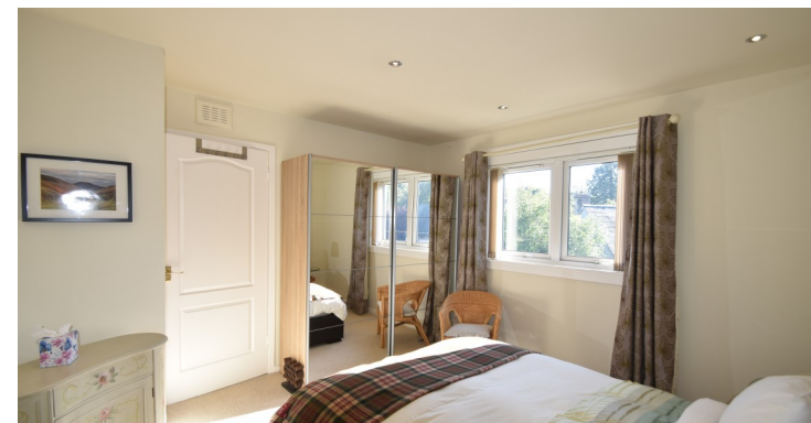
9 The Low Doors