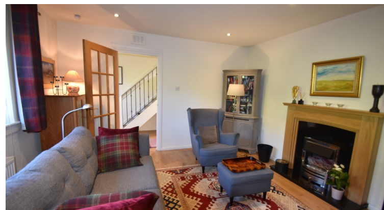
9 The Low Doors

Viewings: Strictly by appointment through Caesar & Howie on 01506 435306 or email mam@caesar-howie.co.uk