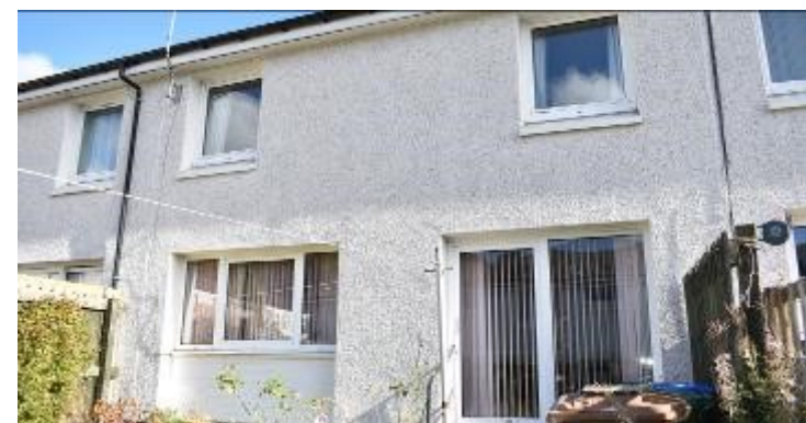
23 Labrador Avenue