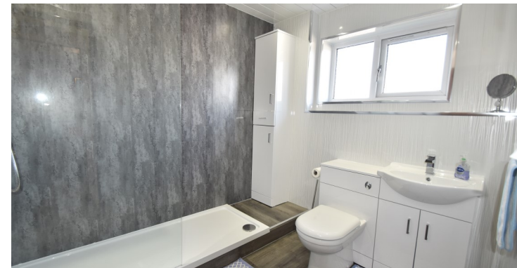
217 Langside Gardens