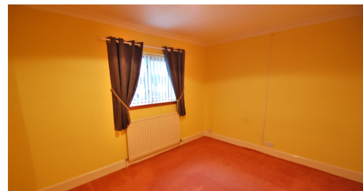
7 Barnhill Drive