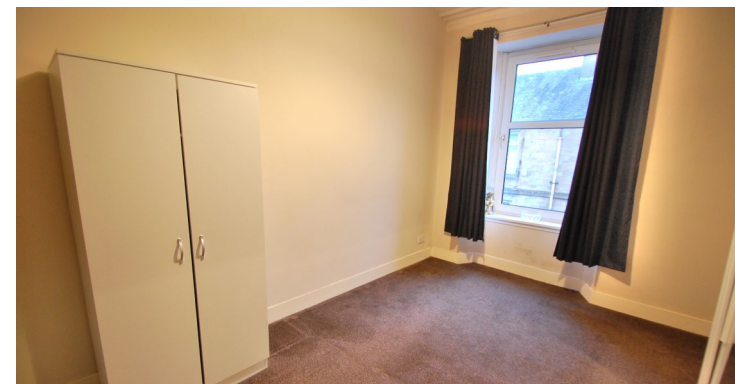
35 Comely Place