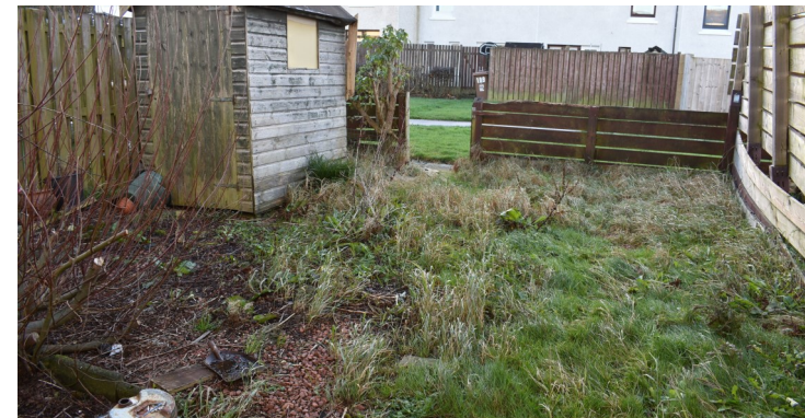
118 Staunton Rise