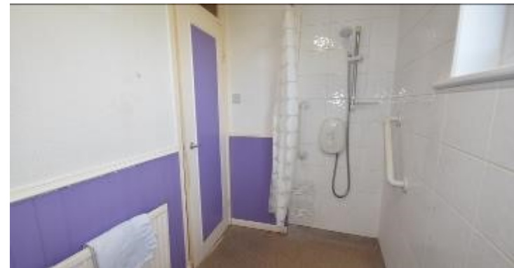
5 Pine Grove