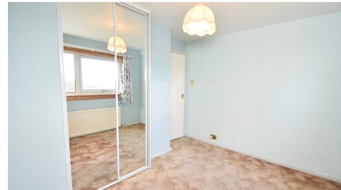
63 The Green