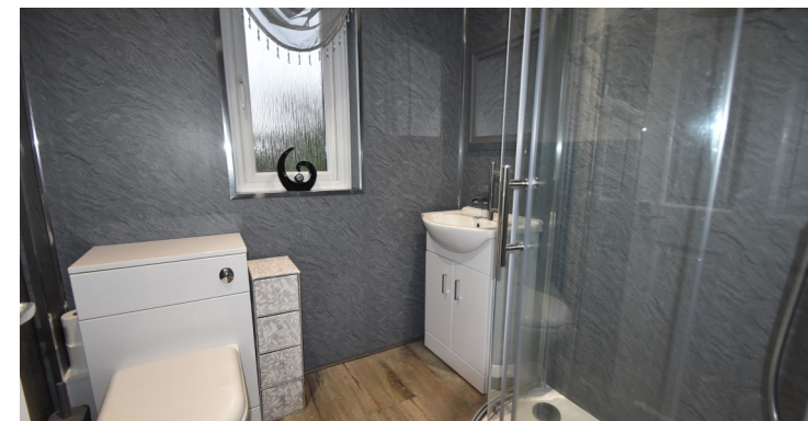
14 Epworth Gardens