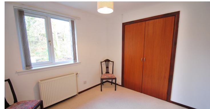
Douglas Hall Cottage