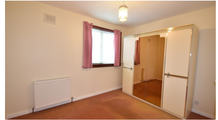
77 Hopefield Road