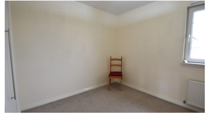
43 Meikle Inch Lane