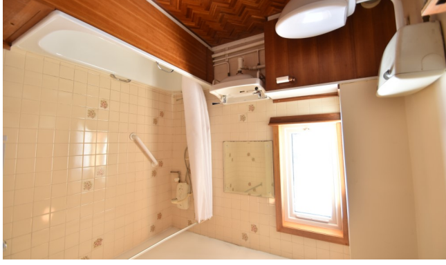
22 Loaninghill Park