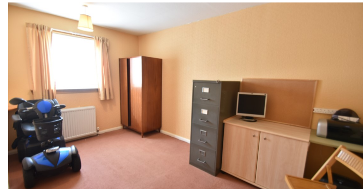
22 Loaninghill Park