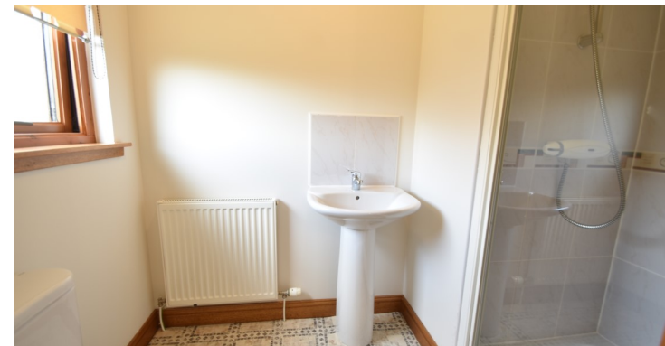
1 Pinewood Place