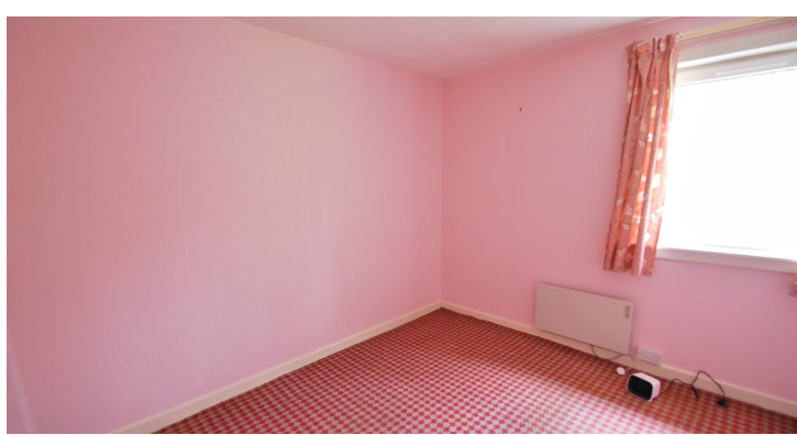
27 Woodburn Drive