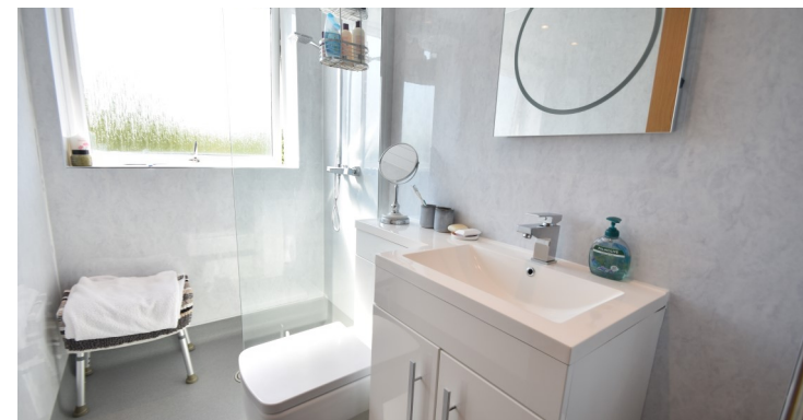
23 Kirkhill Terrace