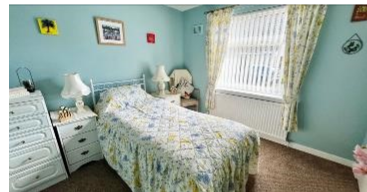
29 Parkhead Court