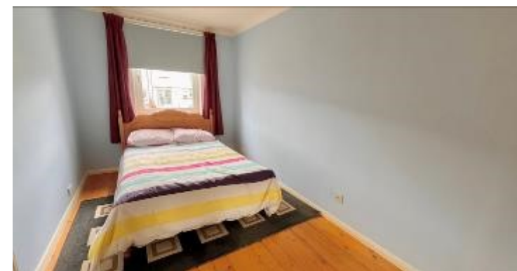
132 Ravenswood Rise