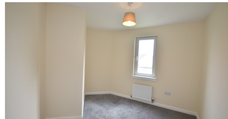
16 Crookston Court