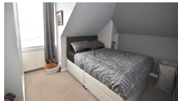
25 Victoria Street