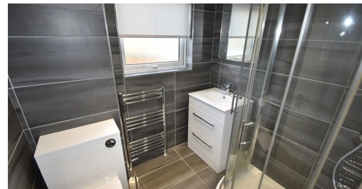
85 Park View