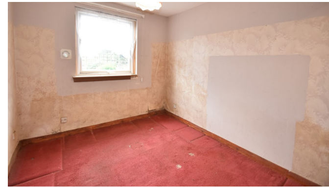
42 Tippet Knowes Park