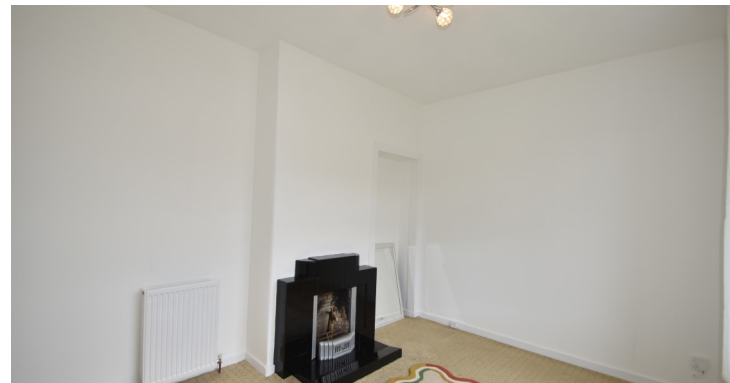
13 Gardner Terrace