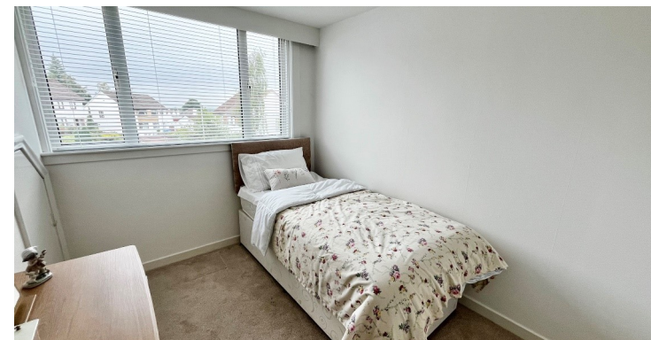
12 Sandyloan Crescent