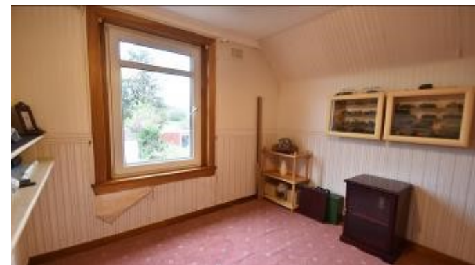
11 Burnlea Drive