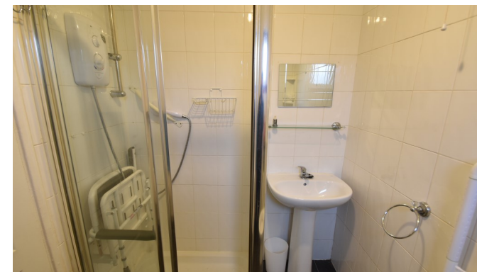
105 Nigel Rise