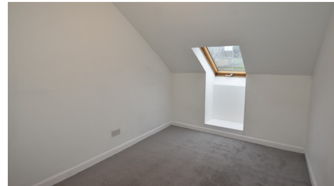
19a Main Street