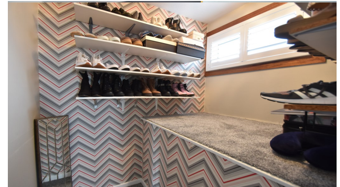
17 Briar Gardens