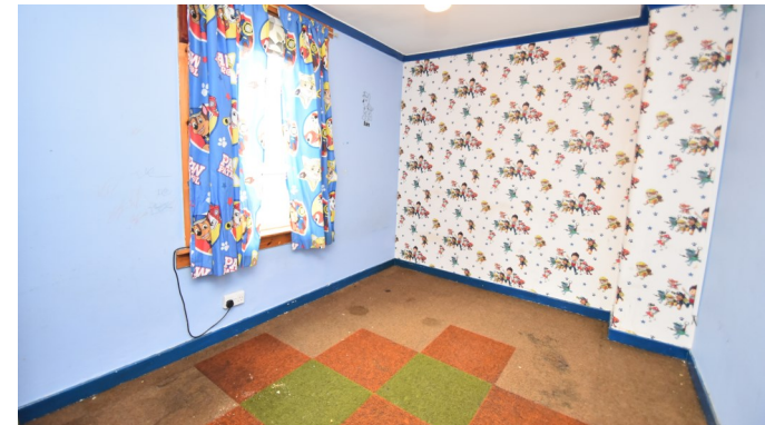
58 Moorelands Gardens